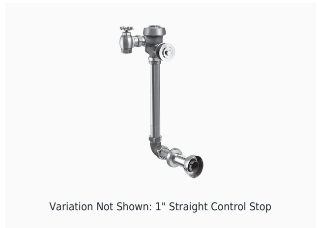
Variation Not Shown: 1" Straight Control Stop