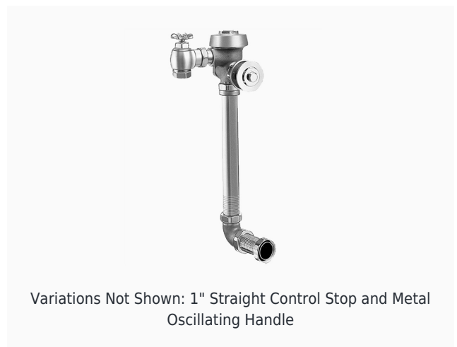
Variations Not Shown: 1" Straight Control Stop and Metal Oscillating Handle