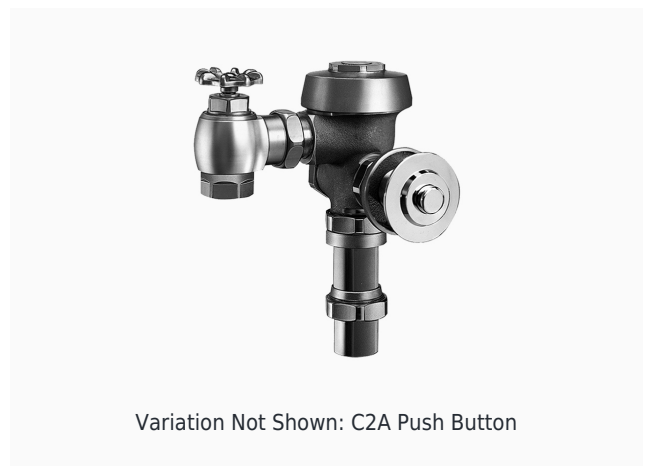
Variation Not Shown: C2A Push Button