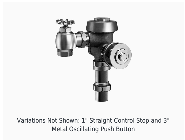
Variations Not Shown: 1" Straight Control Stop and 3" Metal Oscillating Push Button