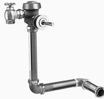
Variation Not Shown: Metal Oscillating Handle