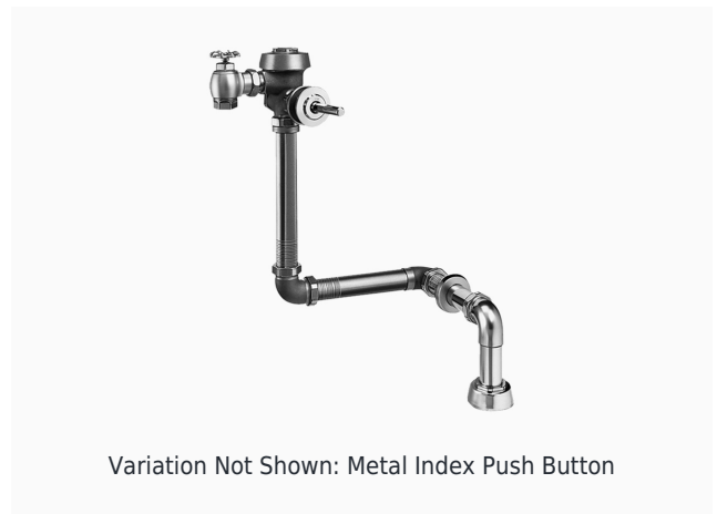
Variation Not Shown: Metal Index Push Button