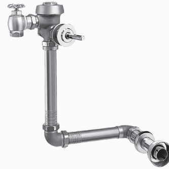
Variation Not Shown: Metal Index Push Button