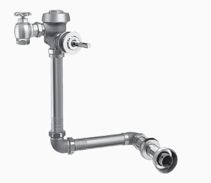
Variation Not Shown: 1" Straight Control Stop