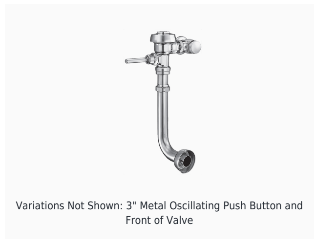
Variations Not Shown: 3" Metal Oscillating Push Button and Front of Valve