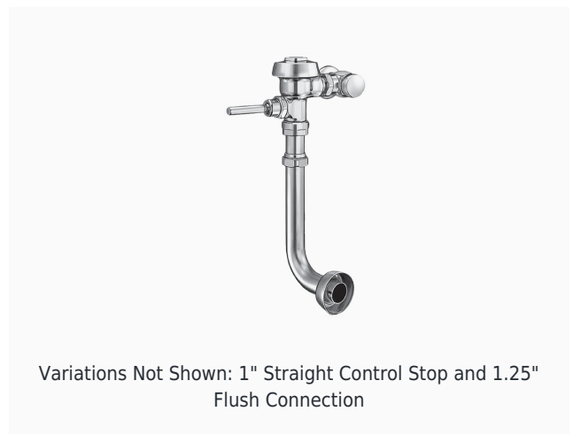
Variations Not Shown: 1" Straight Control Stop and 1.25" Flush Connection