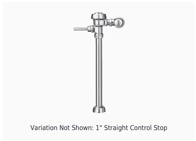
Variation Not Shown: 1" Straight Control Stop