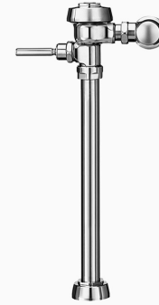
Variation Not Shown: Front of Valve Handle