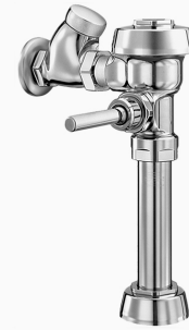
Variation Not Shown: Right of Valve Inlet