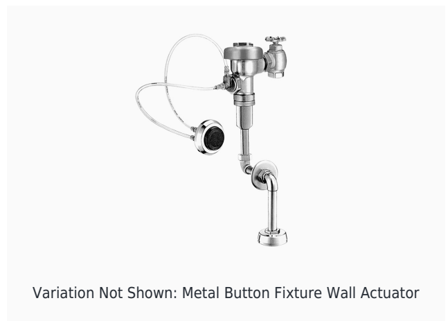
Variation Not Shown: Metal Button Fixture Wall Actuator