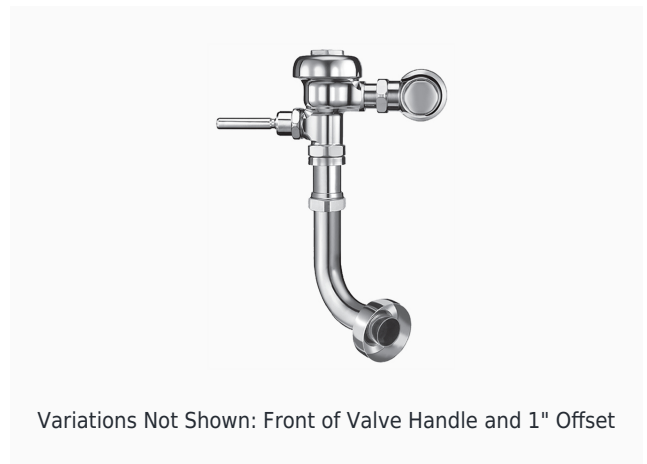
Variations Not Shown: Front of Valve Handle and 1" Offset