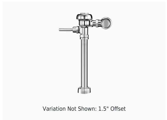
Variation Not Shown: 1.5" Offset