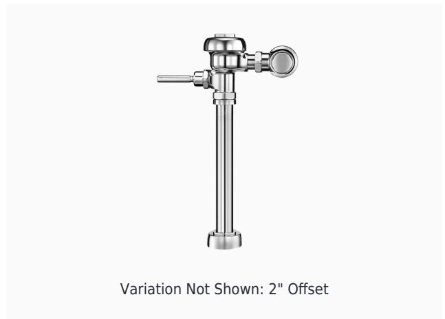
Variation Not Shown: 2" Offset