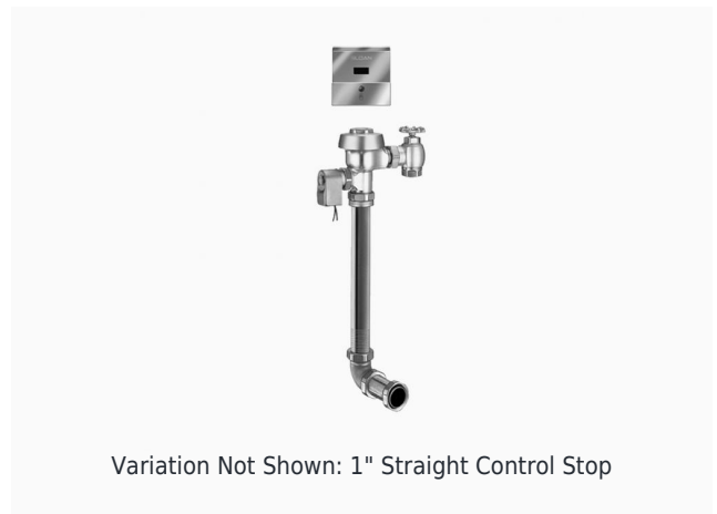
Variation Not Shown: 1" Straight Control Stop