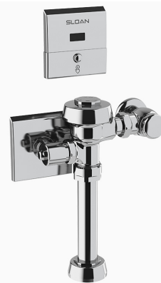
Variation Not Shown: Angle Stop Extended