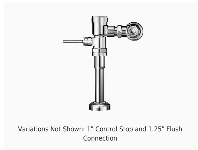
Variations Not Shown: 1" Control Stop and 1.25" Flush Connection