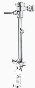
Variation Not Shown: Double Wall