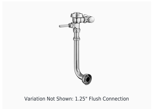
Variation Not Shown: 1.25" Flush Connection