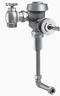
Variation Not Shown: Metal Index Push Button