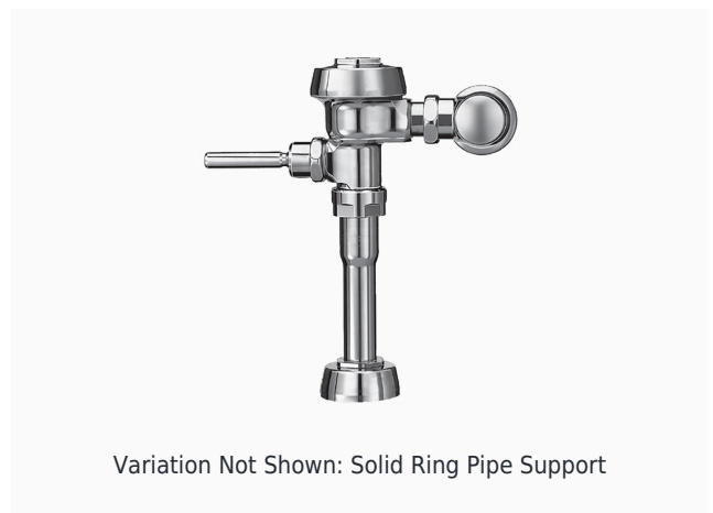
Variation Not Shown: Solid Ring Pipe Support