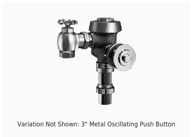
Variation Not Shown: 3" Metal Oscillating Push Button