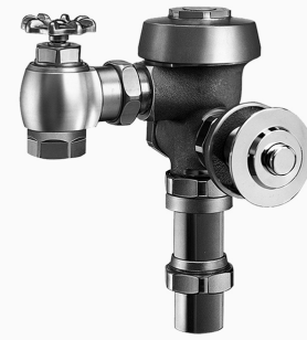
Variation Not Shown: Metal Oscillating Handle