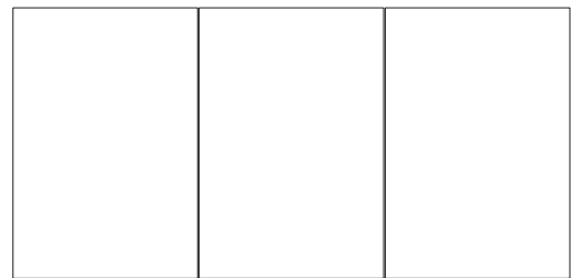
Ganging Cabinet-to-Cabinet Arrangement