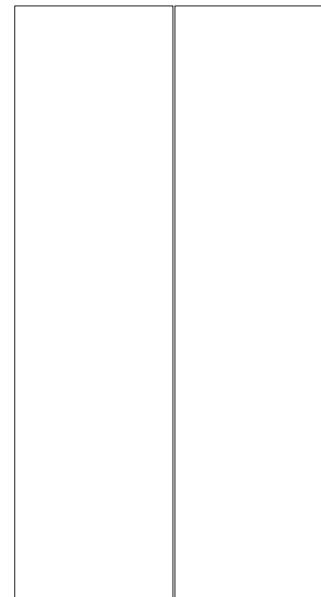
Ganging Cabinet-to-Cabinet Arrangement