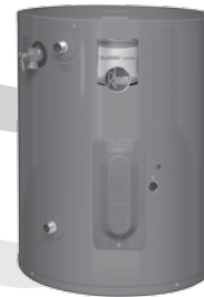
6, 10, 15, 19.9 and 30-Gallon