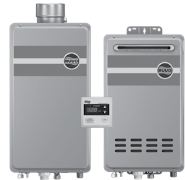
RUTG-DVL RUTG-XL Indoor DV Outdoor 11,000-199,900 BTU/h Natural and LP Gas

See Warranty Certificate for complete information