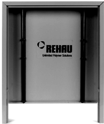
Coverplate and door removed

Installation Note: manifold cabinet should be installed before manifold, screed and thermal mass.