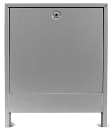
Fully assembled cabinet