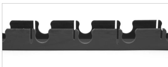
3/4 in. RAILFIX