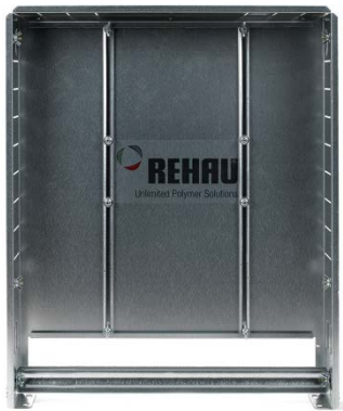
Without frame/door assembly

Installation Note: manifold cabinet should be installed before drywall, manifold, screed and thermal mass.