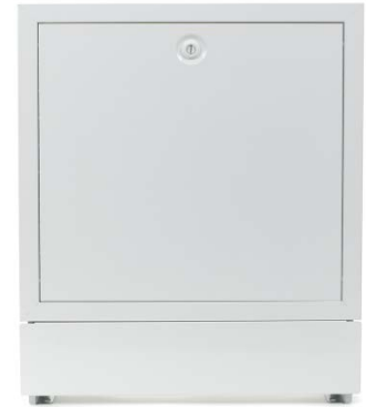
With screed coverplate (sold separately)