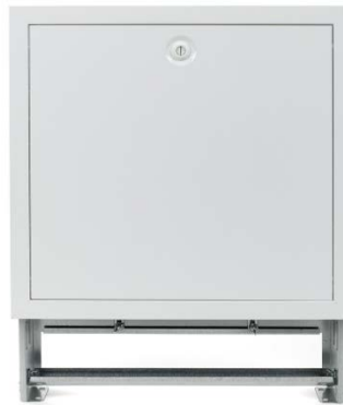
Fully assembled cabinet