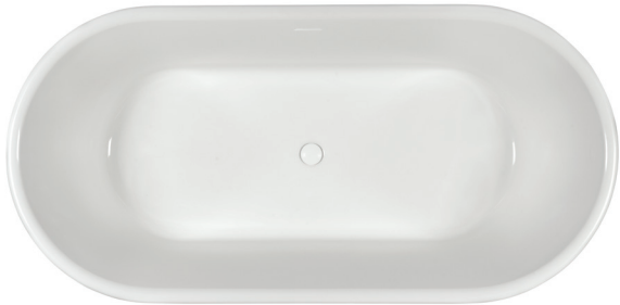
Inside view of tub