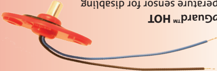
TempGuard™ HOT Temperature sensor for disabling fresh air damper in extreme heat