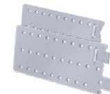
Side Brackets (2)