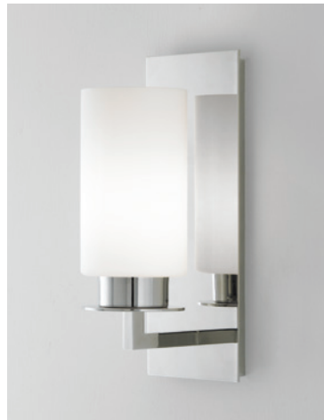
Polished Nickel (PN)