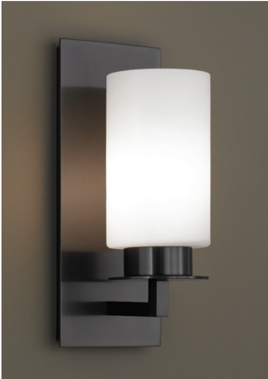
Jade - 9670 Bronze (BR) Matte Opal Glass (MO)