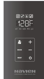
INCLUDED Illuminated Front Panel with Advanced Hydronic Operation