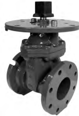
FM609-RWS Flanged x Mechanical Joint