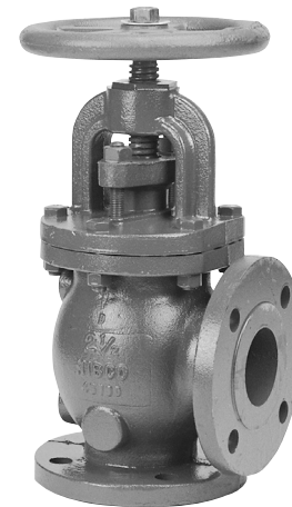
F-838-31 Flanged-Raised Face

Consult Factory for non-return feature. Fig. No. F-838-31NR.