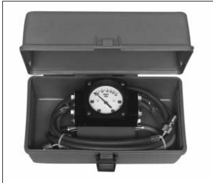
Figure 1022 Test Kit

This Test Kit is equipped with a rugged differential pressure gauge with an accuracy of \pm 3-2-3% full scale (ascending) ideally suited for measuring the pressure drop across various types of equipment (i.e. filters, pumps, balancing valves, etc.)