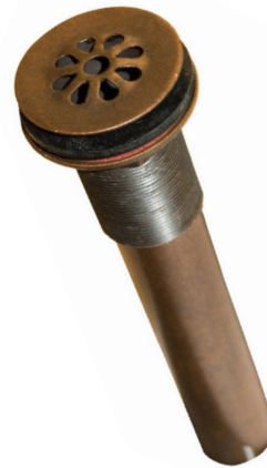
Shown in Weathered Copper