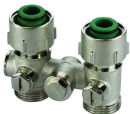
HV-S Straight Pattern Bypass Valve