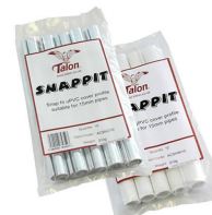
PC8 Pipe Cover