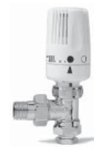
TRV angle w/HEAD