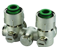
HV-A Angle Pattern Bypass Valve