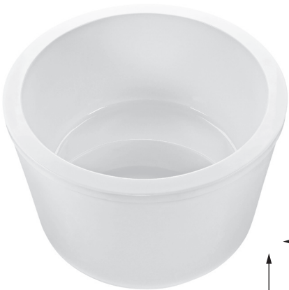
Features integral seat