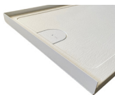
Shown above on Lado shower base

Factory-installed tile flange is 1/16" thick. Account for this thickness when planning final opening size.