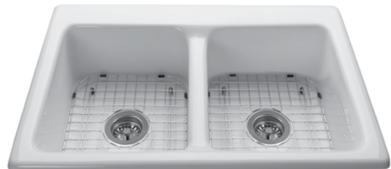
Optional sink grids shown above.

Small Sink Grid - Sold individually. (MBSSG)