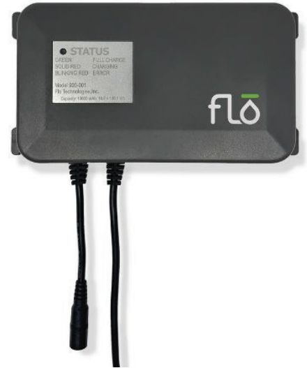
Flo by Moen™ Lithium Ion Battery Backup Model: 920-001