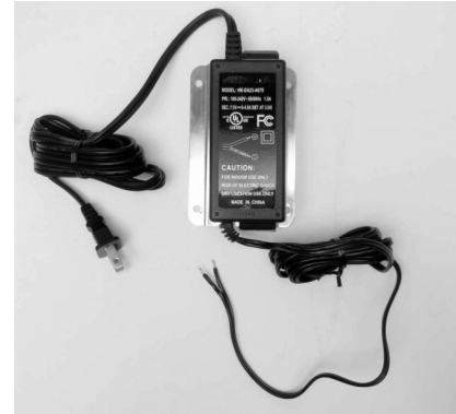
Multi-Unit Power AC Adapter Model: 104408 (adapter)

Warning: Do not touch leads ( + - ) together while unit is plugged in. Unit will fail and warranty will be voided.