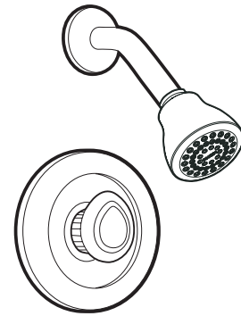
CHATEAU® Single-Handle Shower Trim Kit