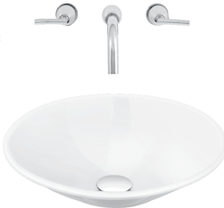
Model 805NS Less faucet, drain assembly and supply